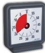
(Time Timer® visual timer)

The rail cars have open sides and I have to keep my hands, feet, and body INSIDE the car and stay in my seat...this will keep me safe when the train is moving. I will be very excited on the train, but have to remember to not shout near other people—it might hurt their ears.